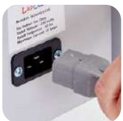
IEC power cable into the mains.