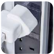
Device adapters plug into 2x10-way powerstrips.