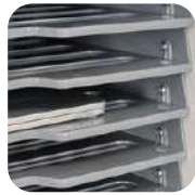
Fixed plastic shelves with ventilations.