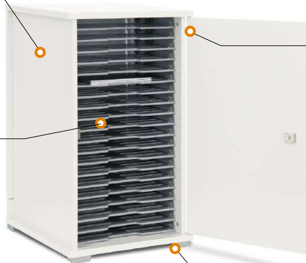
Large doors open wide.