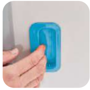
Inset door handles.