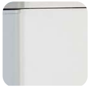
Strong MFC cladding.