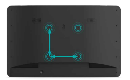
75 x 75 VESA

Unlike domestic tablets these displays have an integrated and secure screw based mounting solution on the rear for easy wall or stand installation.