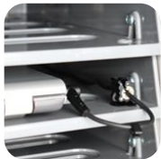
Clips to keep cables in place and free from damage.