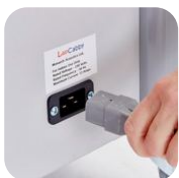
IEC socket with 1.8m designed to snap out if pulled away.