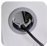
Cable clip portholes feed cables.