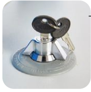
Dual point locking Key system.