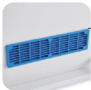
Well placed vents allow constant air circulation.