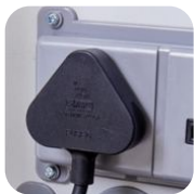
Device adaptors plug into 4x8-way power strip.