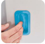
Inset door handles.