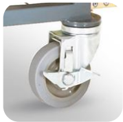
Non-marking hospital grade rubber wheels.